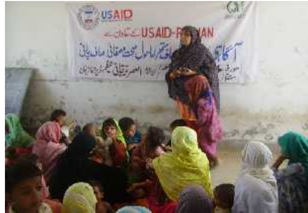
Al-Asar, in collaboration with USAID-PAIMAN , organized 10 Mobile Medical Camps and 10 Awareness-raising Sessions on/for Health & Hygiene issues.