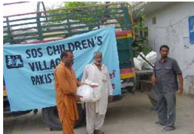
Al-Asar received Food items for 300 families from Concerned Citizen Society and SOS Children Village and distributed among affectees at distribution point in Al-Asar Complex