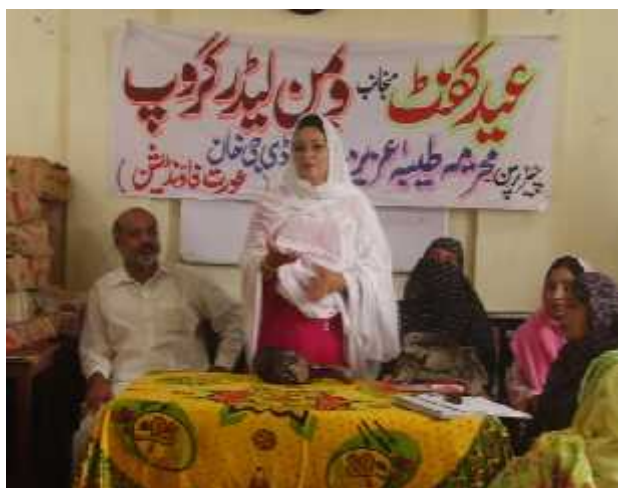
Al-Asar, in collaboration with Punjab Welfare Trust for the Disabled, organized 10 Mobile Medical Camps.